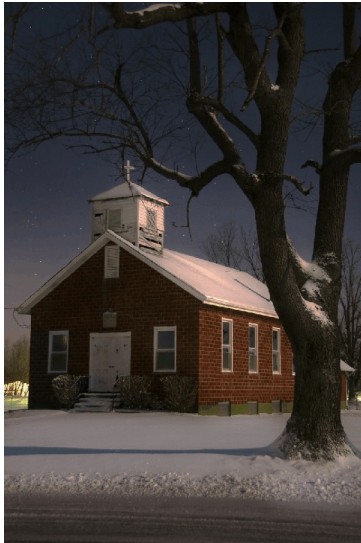
“Little Flock Church by Moonlight” by Bill Fogle

And an honorable mention went to Rita Kent for her photo titled “Four Freedoms.”